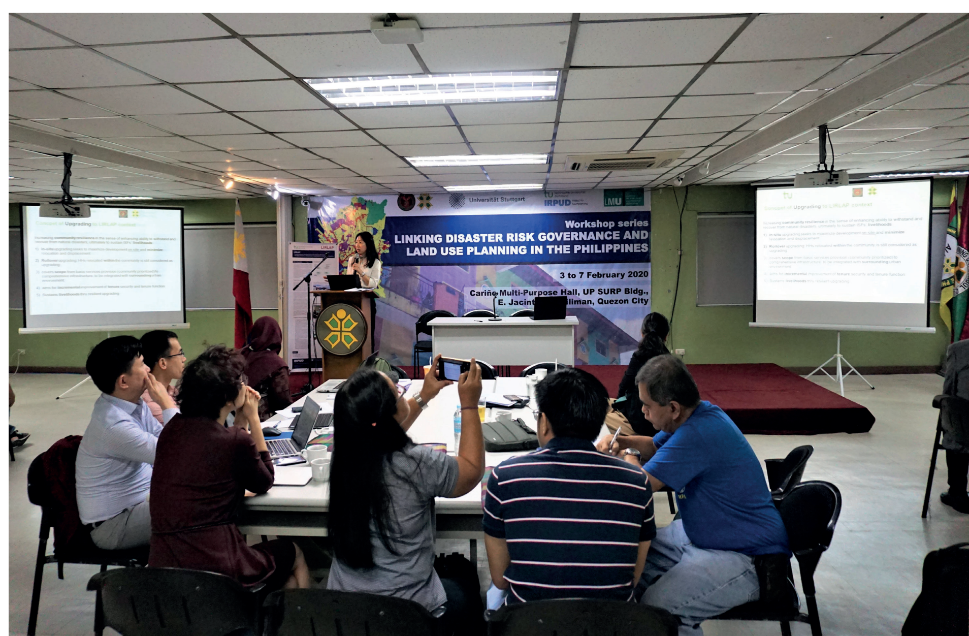
LIRLAP multi-stakeholder interim results workshop, photograph by LIRLAP team