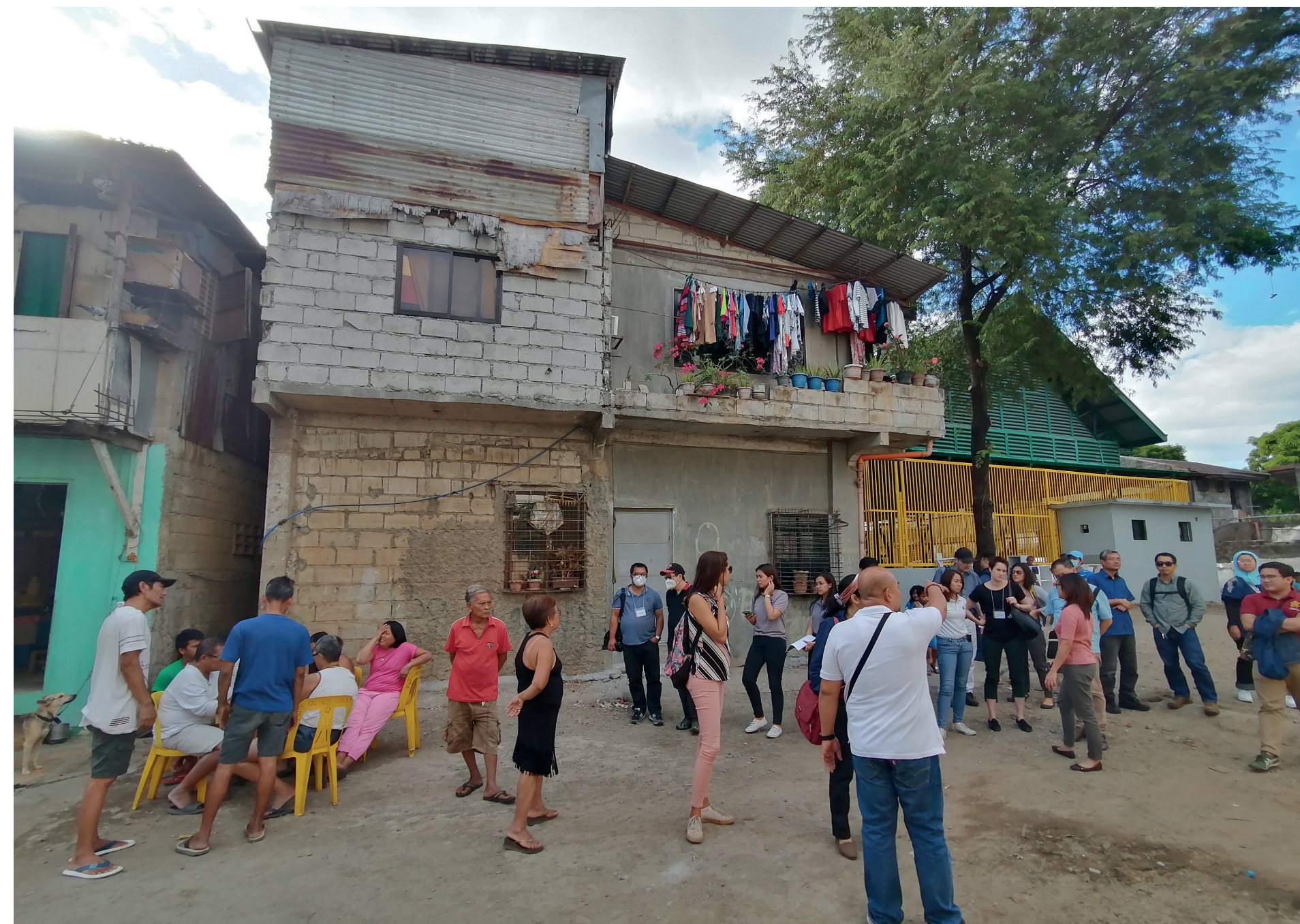
Visiting a low-lying flood-prone informal settlement in Marikina City, Metro Manila on 04.02.2020